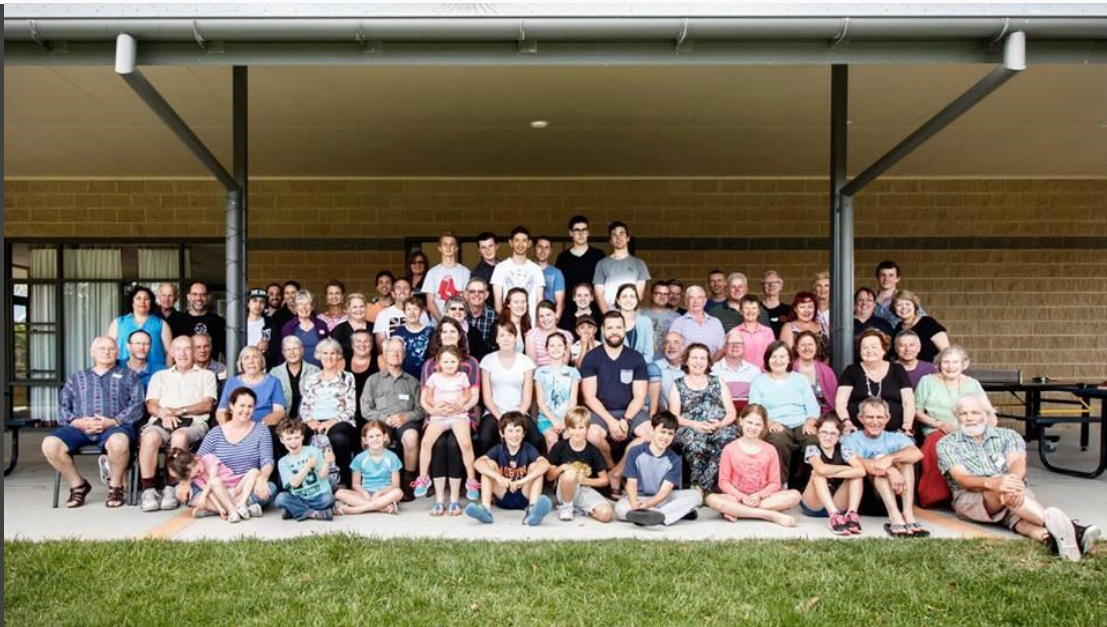
New Church summer camp organized by the Hurstville congregation held at a retreat center located about an hour south of Sydney, Australia.